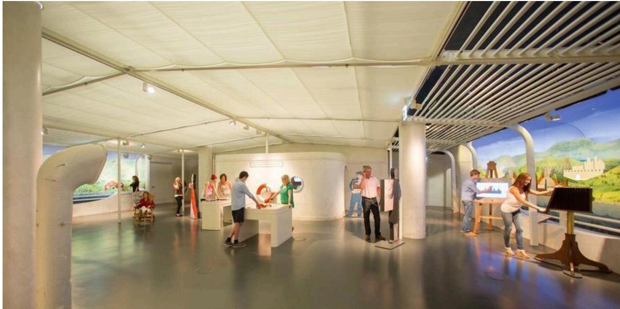
Romanticum | ©PIELmedia